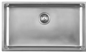
Sink KE - R15 Vintage 2157 080